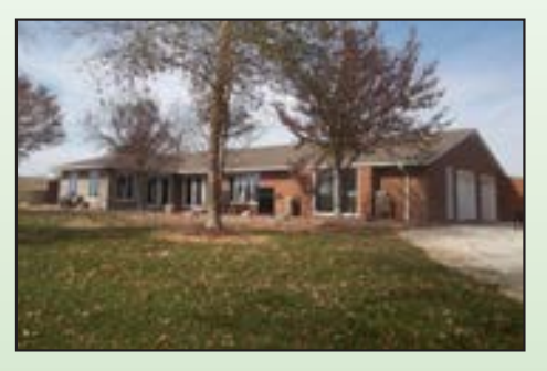
1780 NCR 1600 - Carthage, IL - $239,900 Beautiful country home situated northwest of Carthage, consists of 3 -4 bedrooms, open floor plan living room/kitchen with Cherry cabinetry and granite countertops, 2 full baths, utility room, dining room, family room/sunroom, GeoThermal heat and central air, 2 car attached garage with 2 electric overhead doors.

Route 1, Box 54, Terre Haute, IL - $74,900 This two bedroom, 1.5 bath home features 2012 square feet of living area with the kitchen, living room, dining room, 2 bedrooms and 1.5 baths all located on the main level. The home has a full, unfinished basement. Two car garage with electric openers.