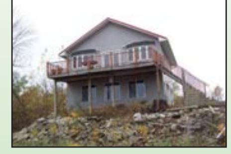
245 6th Street - Pontoosuc - $62,500 This vacation cottage was built new in 2005. It features an open floor plan with a kitchen/living room combination, one bedroom and a full bath which includes a utility room. Also has 2 car garage and wood deck overlooking the river.